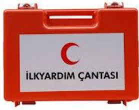
first aid kit