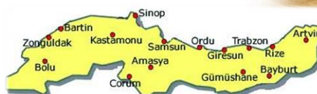
Black Sea Region